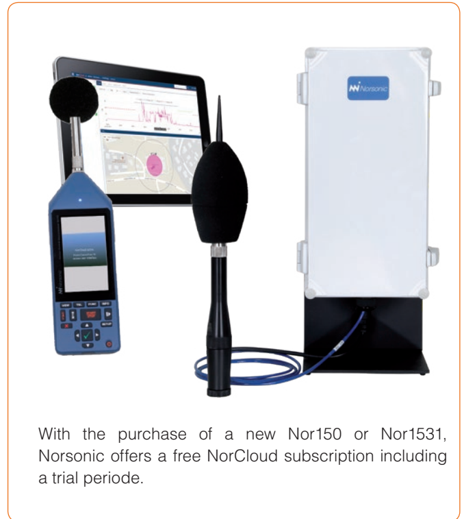
With the purchase of a new Nor150 or Nor1531, Norsonic offers a free NorCloud subscription including a trial periode.